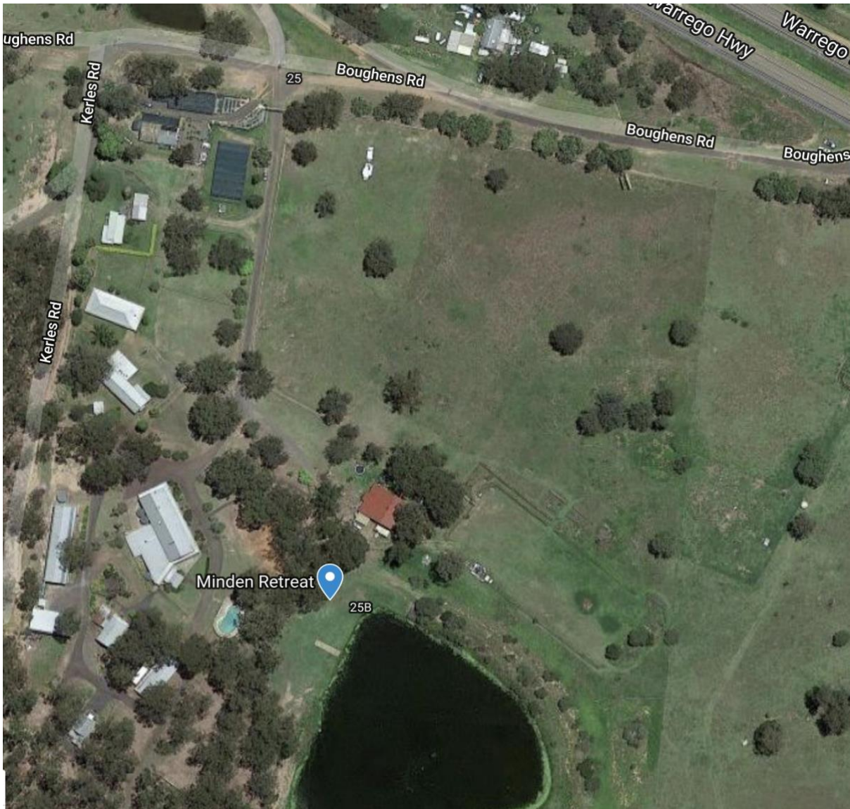
Ariel Vision of Campsite